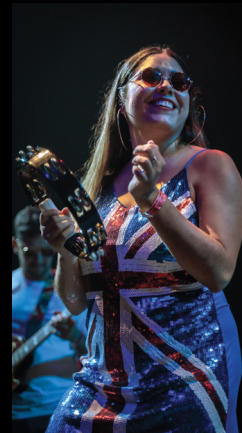
Tied for Song of the Year: Re-Union Jacked, Cirrus Logic