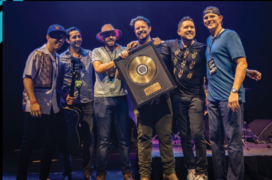
Band of the Year: The C Notes, PNC Bank