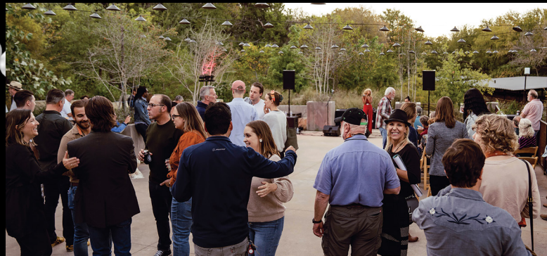
Pearl Society members enjoying the music of Mélat on Oct. 26 at Pease Park.