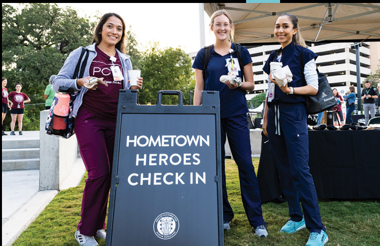
Frontline workers celebrated as Hometown Heroes at HAAM Day.