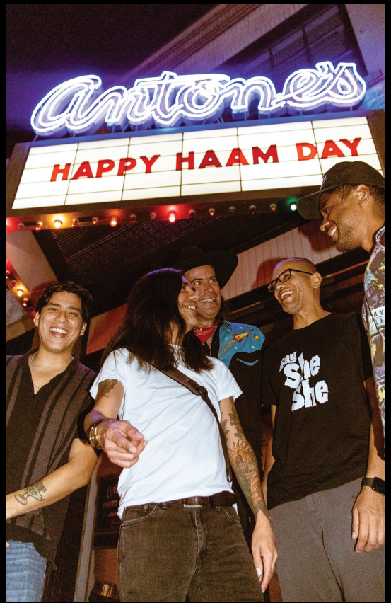
Como Las Movies after their HAAM Day show at Antone's.