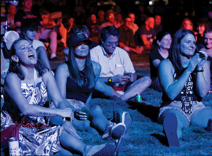
HAAM Day audience enjoys evening performances at Moody Amphitheater.