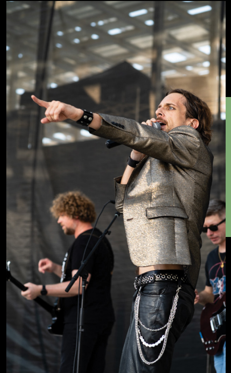
Kings of the Night Time World perform at Moody Amphitheater.