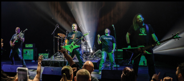
Best Showmanship: Knuckle Sammich, H-E-B