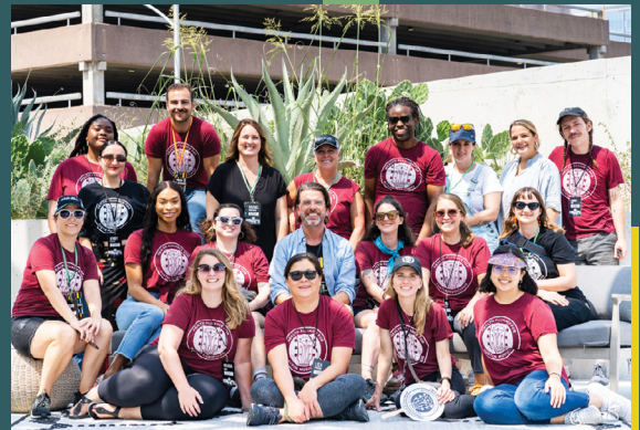
The HAAM Team at HAAM Day 2022.